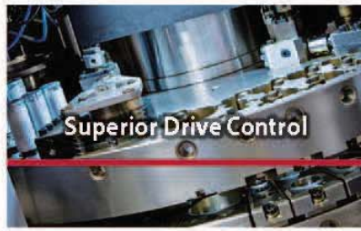
Superior Drive Control