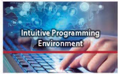
Intuitive Programming Environment